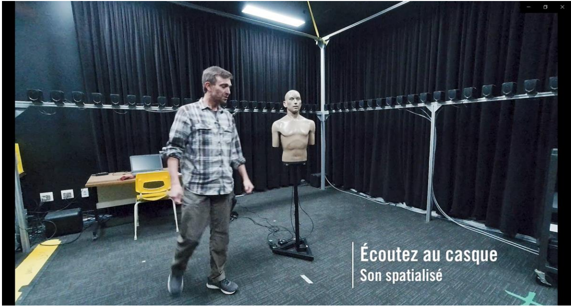
Figure 3: Screen capture of the teaser made for introducing the series of four videos.